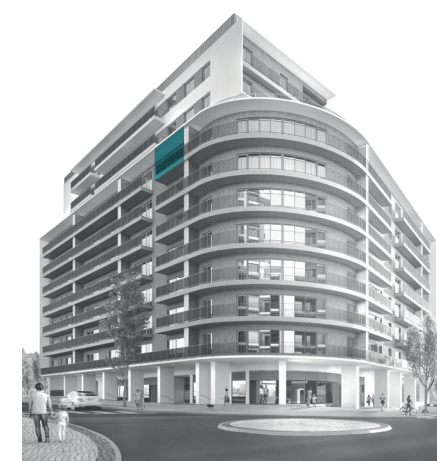
Orientação: Norte Orientation: North