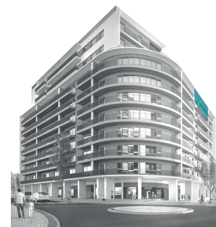
Orientação: Oeste Orientation: West